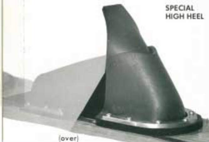
SPECIAL HIGH HEEL