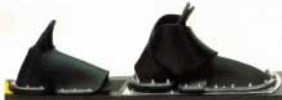
Special High Heel Back Boot

Mr. M — High Double-Wrap Front Binding has Individual Sizes 5-13